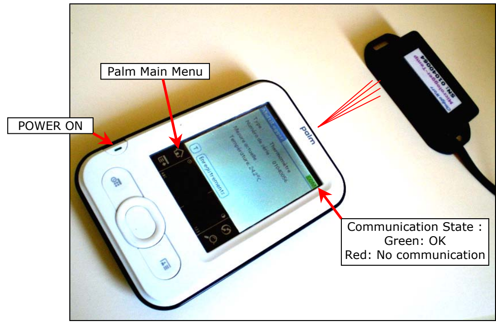
Example of IR communication using Palm Zire 22. Communication between a logger and a PDA